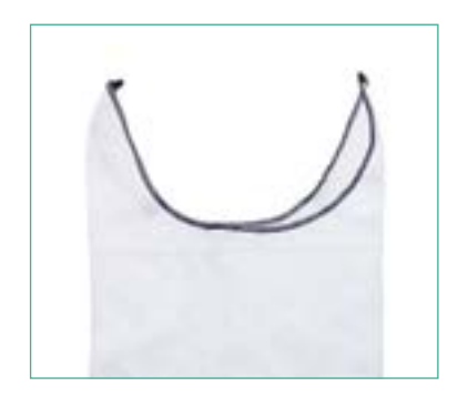
Critical Care • Breathing Systems