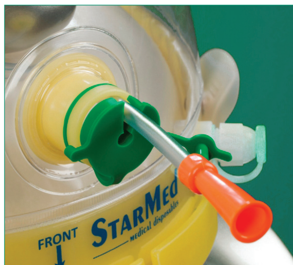
New sealed access For probes or catheters

CaStar R Next hood with anti-suffocation valve, patient access port, ear plugs and measuring tape