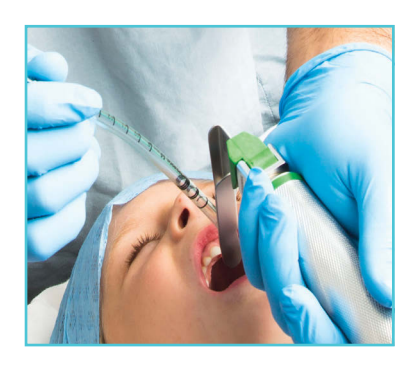
Airway Management • Airway Devices