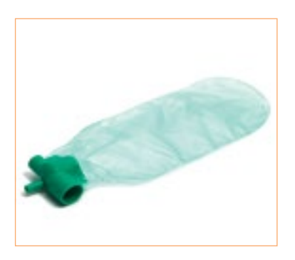
Oxygen and Aerosol Therapy • Oxygen Therapy